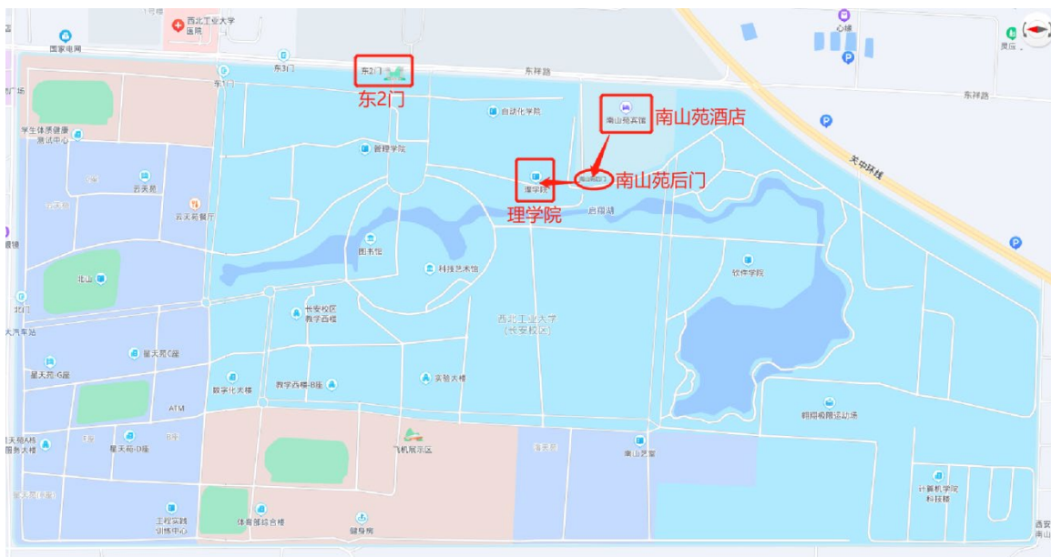
Fig.2. The map of Chang 'an Campus of Northwestern Polytechnical University