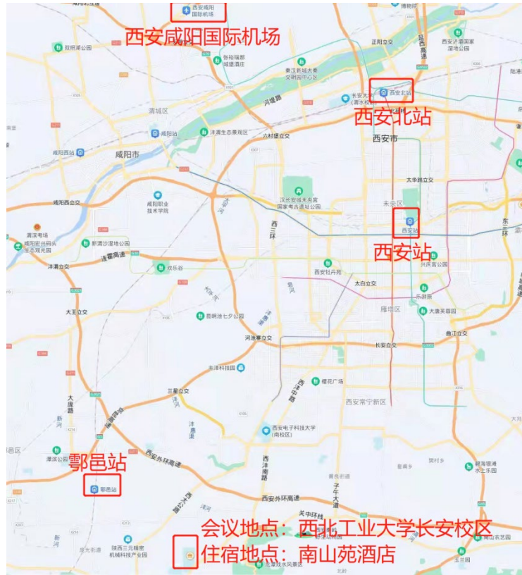
Fig.1. The map of Xi'an