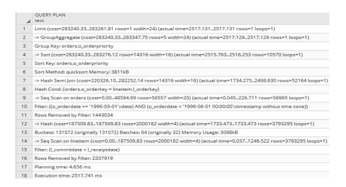
Figure 2: A QEP in PostgreSQL (Enlarged view at [5]).

the visual tree representation of the QEP [5] for better comprehension. Although relatively succinct visually, it simply depicts the sequence of operators ( e.g. , hash \rightarrow hash semi join \rightarrow sort \rightarrow aggregate \rightarrow limit) used for processing the query, hiding additional details about the query execution. In fact, Bob needs to manually delve into details associated with each node in the tree for further information.