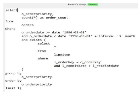
Figure 1: Query 4 in трс-н benchmark dataset.

ACM ISBN 978-1-4503-5643-5/19/06...$15.00