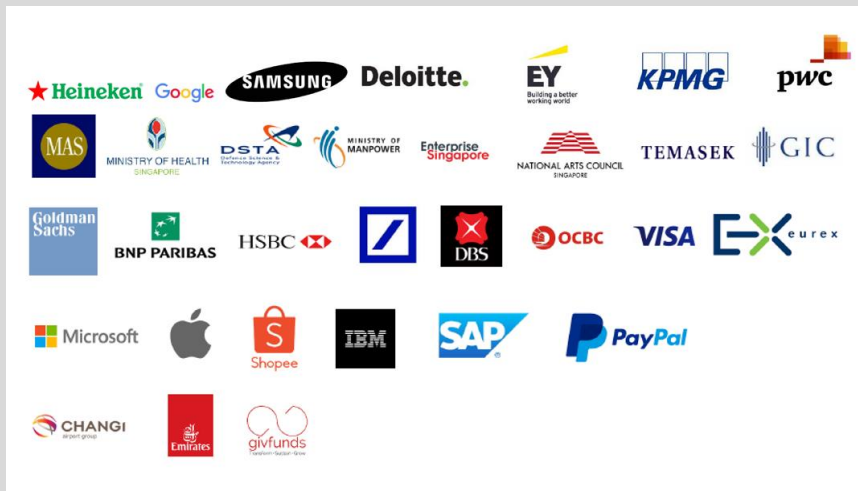
The above information extracted from CareerSocius Business & Consulting package

To inspire you, here are just some doors/organisations that your seniors have landed to launch their career.