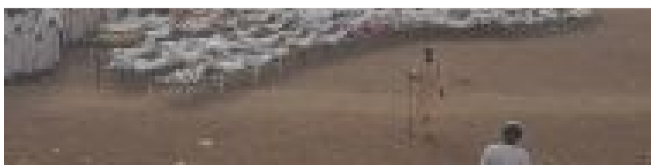
Sudanese RSF paramilitaries clash with the army, leaving at least 100 people dead