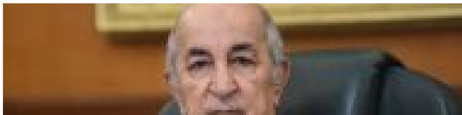
Algerian President calls for holding presidential elections in September