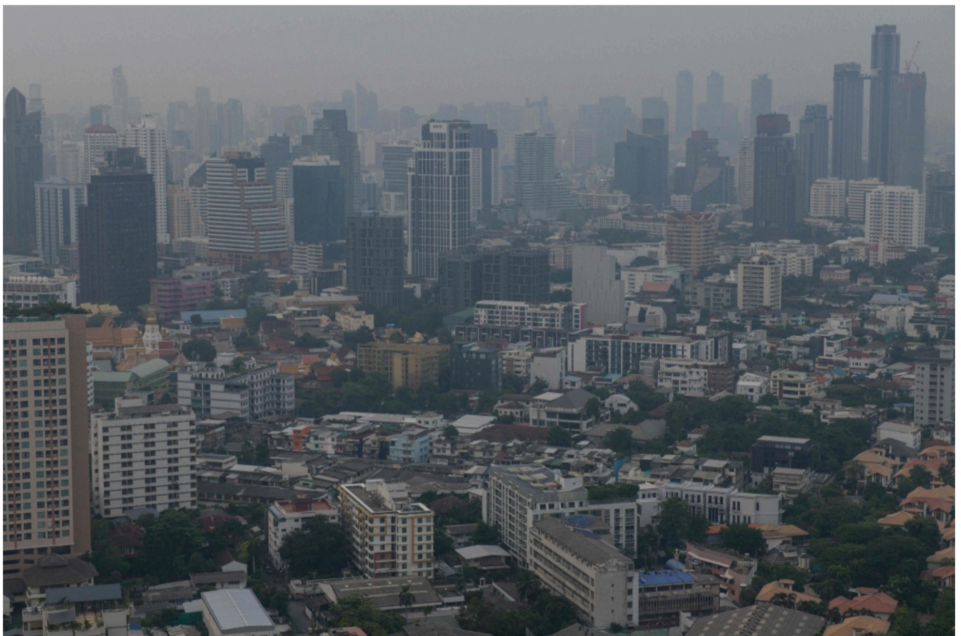
The city skyline is pictured amid high levels of air pollution in Bangkok on October 18, 2023.

Published: 10 Jun 2024 - 12:53 pm | Last Updated: 10 Jun 2024 - 12:58 pm