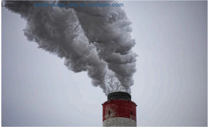
Weather patterns increased the deaths by 14 percent, the study found (Representational)

In Squabble Over Minister Berths, Ajit Pawar, Eknath Shinde's Waiting Game