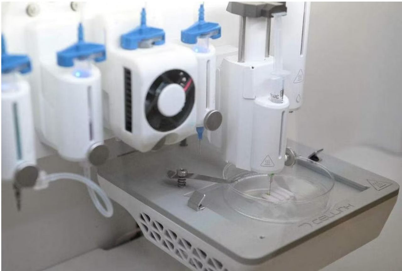
Bio-printing opens the doors to drug delivery testing as it allows researchers to observe how a patient's tissue might react to substances without putting any human at risk.

Among the 3D printed materials that will be trialled in the partnership are porous metal implants that are more flexible than traditional metal implants and reduce the chances of bone degradation.