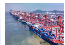
COSCO predicts an increase of 97.2