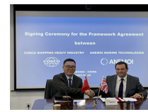
Anemoui and COSCO Shipping Heavy

Jointly launched by SMI and MPA on 28 April 2022, and supported by the National Research Foundation Singapore, the Maritime AI Grant Call is a follow-up to the series of Memorandum of Understandings (MoUs) signed during the 2021 SMI Forum to address industry-wide gaps and opportunities arising from the increased use of automation and autonomy in the maritime industry. To kick-start this effort, SMI will be