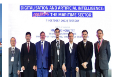
Singapore Maritime Institute partners