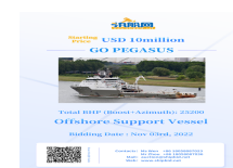
Bidding Announcement of