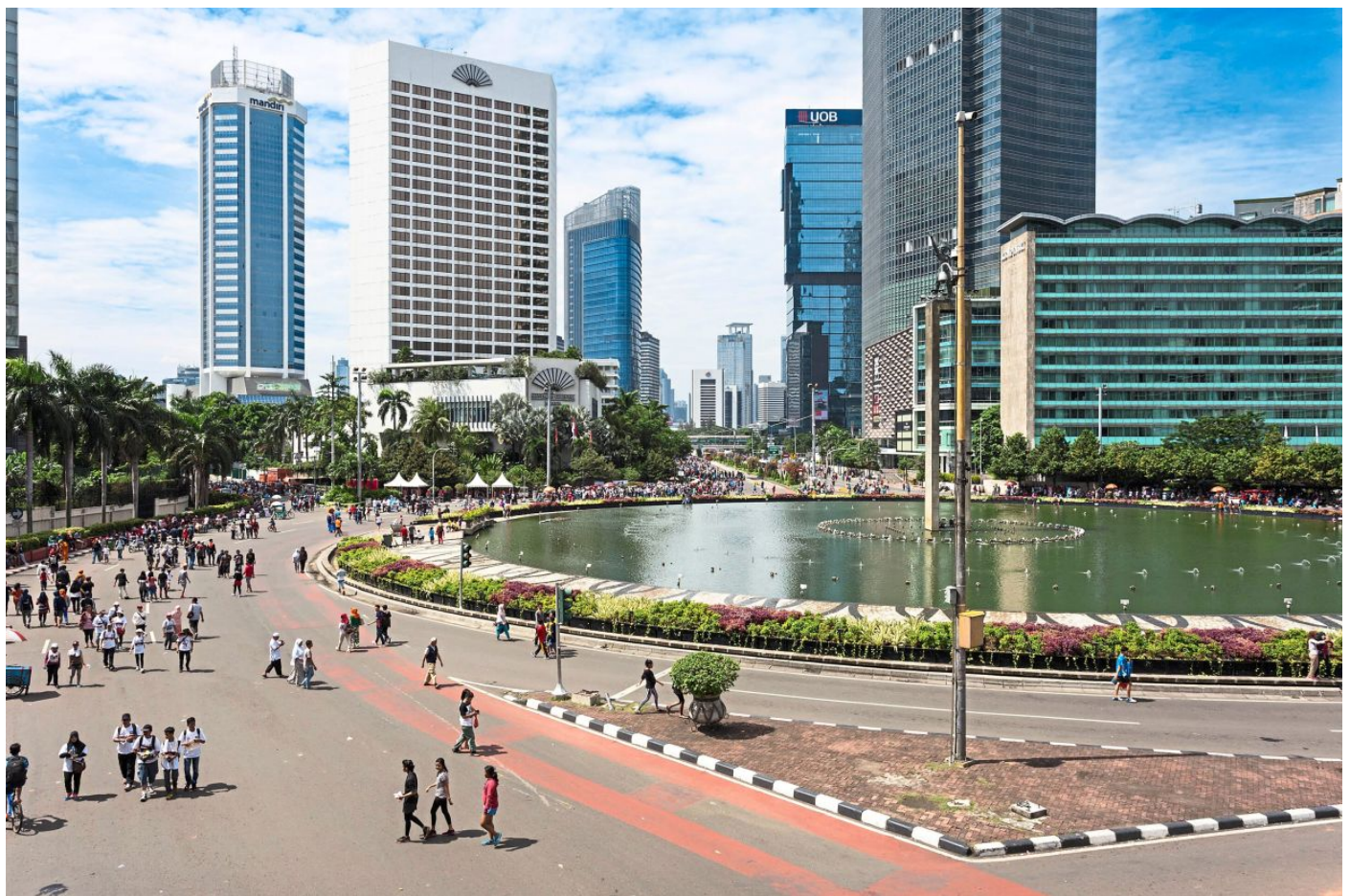
According to a recent study by Singapore's Nanyang Technological University (NTU), Jakarta (pic) and Yangon are sinking more than 20mm in peak years.

Sprawling coastal cities in South and South-East Asia are sinking faster than elsewhere in the world, leaving tens of millions of people more vulnerable to rising sea levels, a new study says.