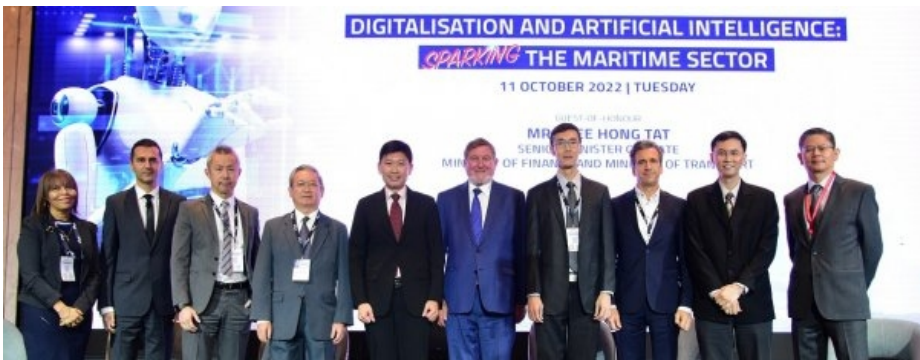
The decision was announced at an SMI event in Singapore on Tuesday.

Singapore's authorities are set to provide Nanyang Technological University with S$12 million ($8.3 million) in funding for maritime decarbonisation projects.