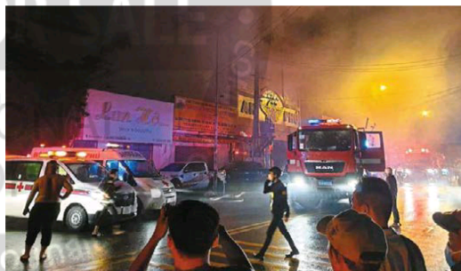
Fatal disaster: Firefighters at the scene of the fire at the karaoke bar in Binh Duong province, Thuan An city.