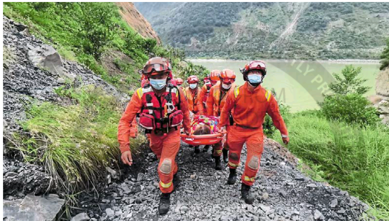
To safer ground: Rescue workers carrying an injured person after the earthquake in Luding county, Ganzi prefecture, in the southwestern Sichuan province.

Following the quake, police and health workers refused to allow anxious residents of apartment buildings out, adding to anger over the government's strict "zero-Covid policy" mandating lockdowns,