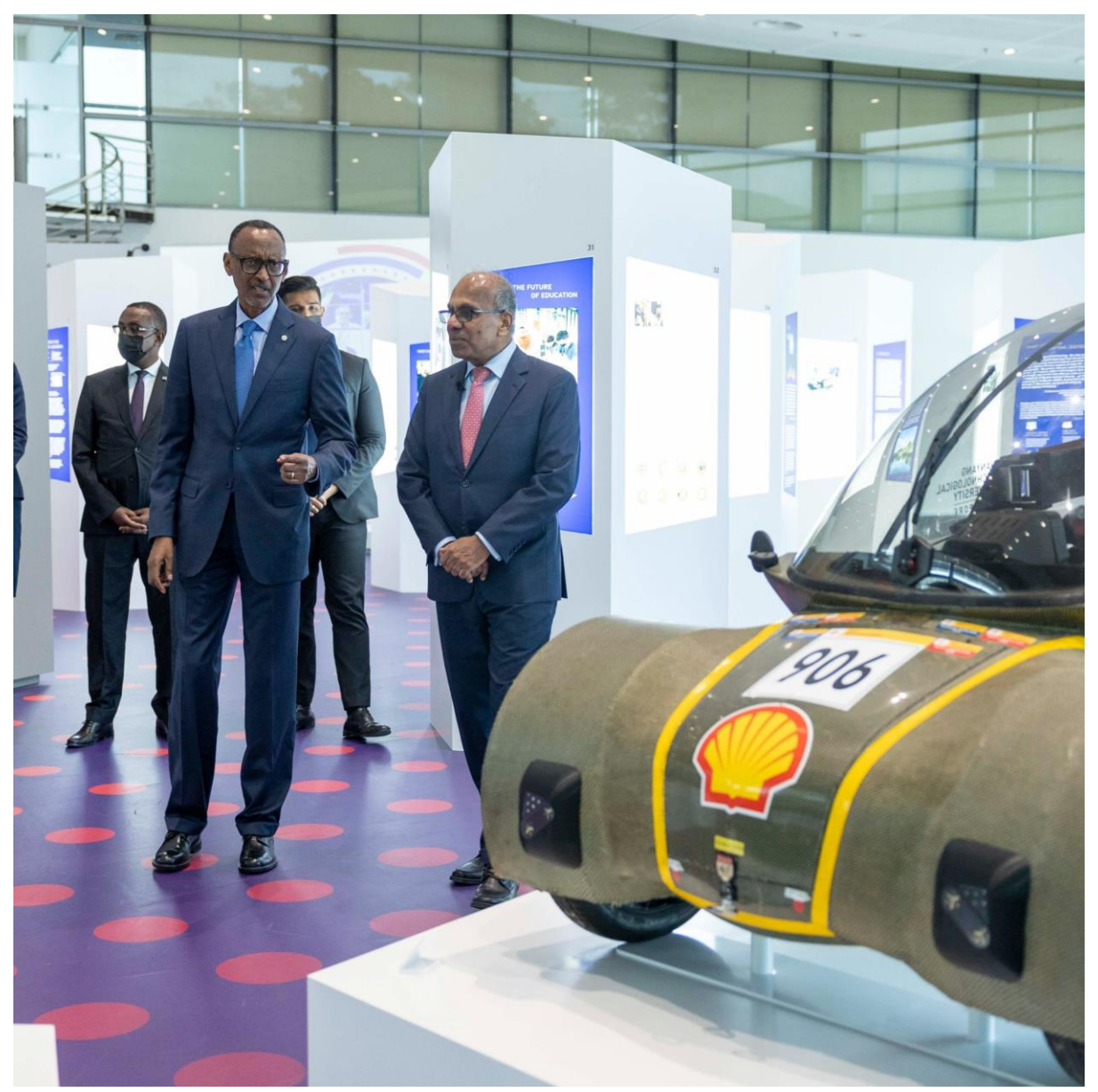
President Paul Kagame today started a three day visit to Singapore

ByJean de la Croix Tabaro September 30, 2022 at 4:43 pm 0