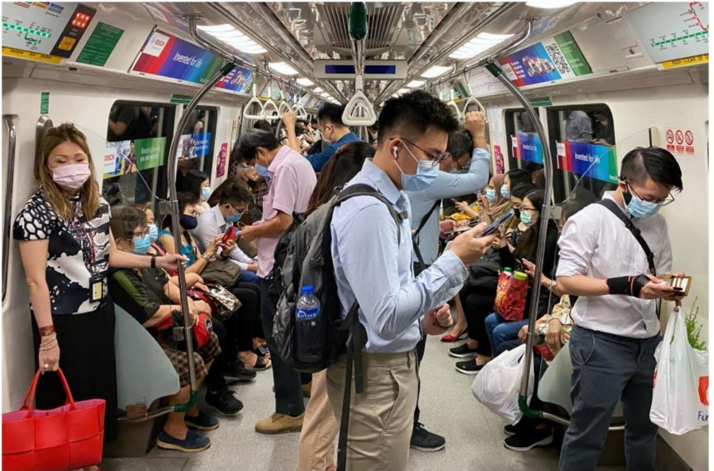
Crowded trains accounted for 12.8 per cent of an employee's decision to work from home or the office.