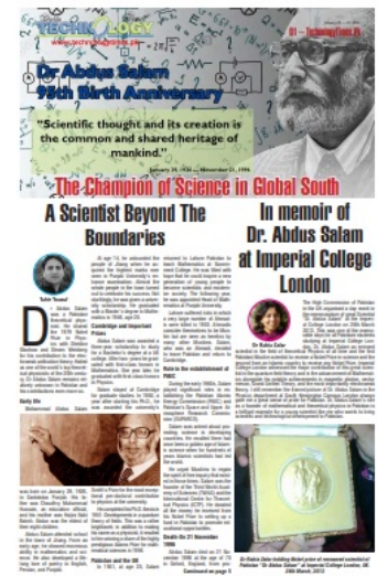
Supplement-Dr Salam 2021

Ms Tan added: "This technology is highly versatile as the coated probiotics can be incorporated into many different product types, including dietary supplements and pills, food and beverages, and even animal feeds."