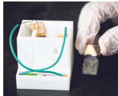
Left: A high-resolution 3D map of a fingerprint, held next to the portable skin-mapping device which weighs 100g.