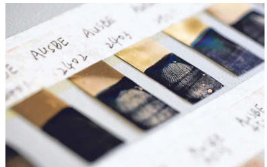
Below: A collection of 3D prints of the skin.