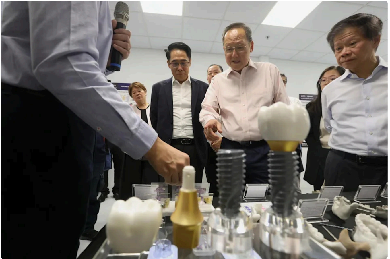
Minister-in-charge of Energy and Science and Technology Tan See Leng looking at models of tooth implants at the National Dental Centre Singapore during the opening of the NTI-NTU Corporate Laboratory on April 20.