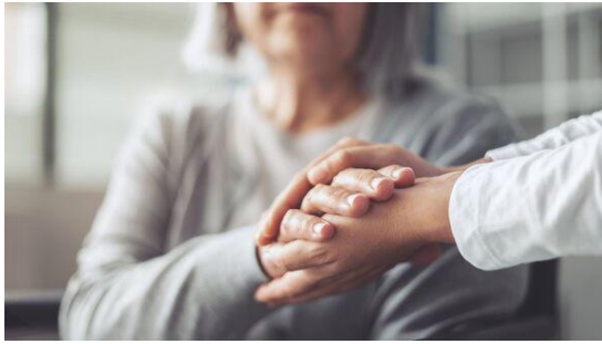
Hands holding old woman's hands