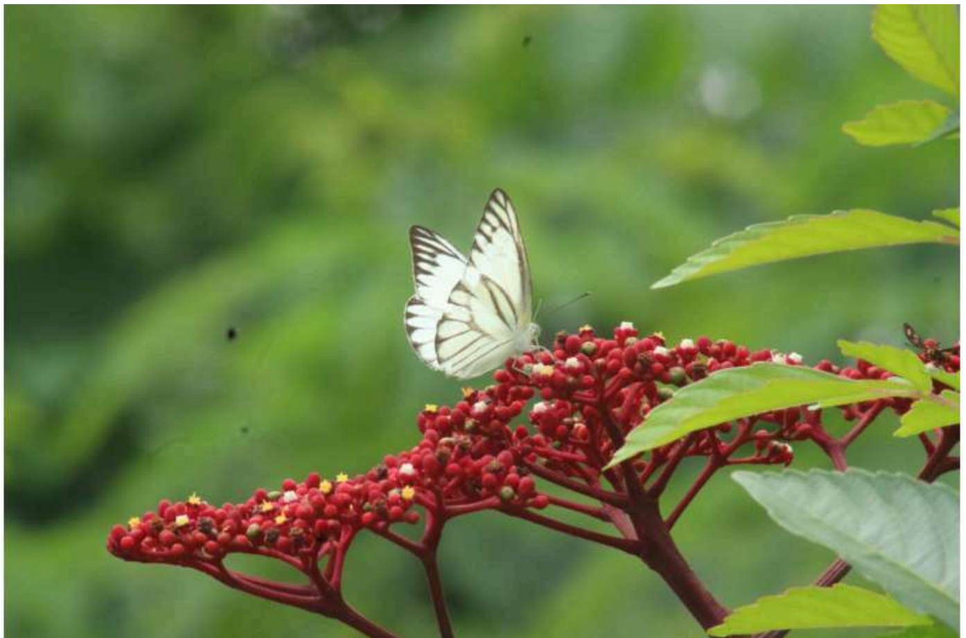
A Striped Albatross butterfly ( Appias libythea ) feeding on nectar from a Red Leea ( Leea rubra ) within a road verge in Singapore's Jurong town. Red Leeas are commonly planted in verges and native to the country.