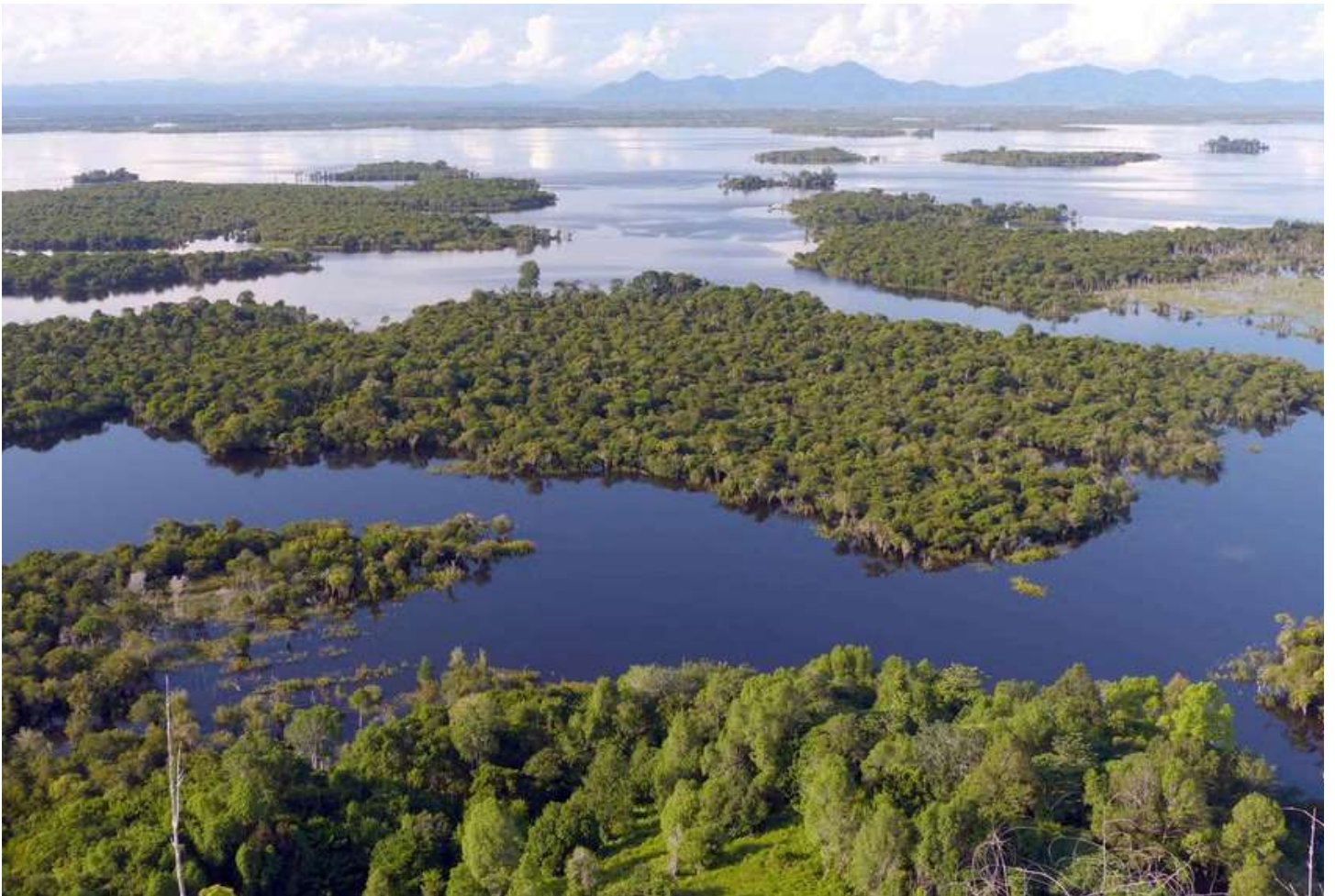
The oldest tropical peatland in the world at Upper Kapuas Basin in Indonesian Borneo.

South-east Asia's wetlands are increasingly being recognised for their ability to store large amounts of carbon, helping humanity tackle climate change. To mark World Wetlands Day on Feb 2, The Straits Times spotlights the research being done on the region's mangroves and peatlands, and how they can be better protected.