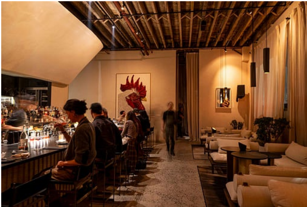
Ilis in New York, United States, by HAND.