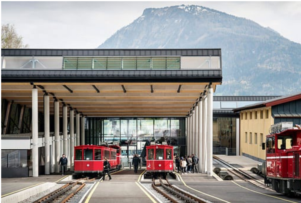
Schafbergbahn Station in St. Wolfgang, Austria, by dunkelschwarz. Image: © Albrecht Imanuel Schnabel