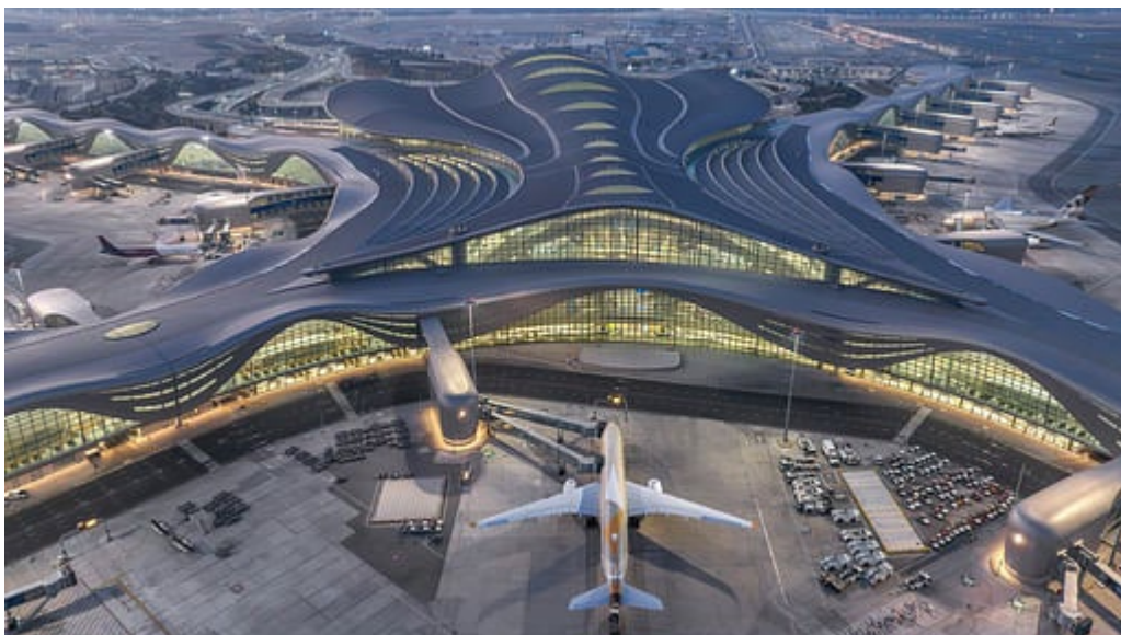
Zayed International Airport in Abu Dhabi, UAE, by KPF.