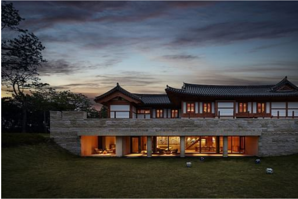
The Hanok Heritage House in Yeongwol, Republic of Korea, by Listen Communication (interior design).