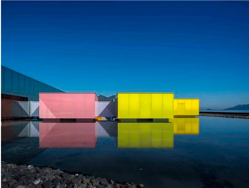
Simose Art Museum in Hiroshima, Japan, by Shigeru Ban Architects.