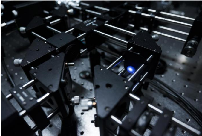
A blue laser device used to generate entangled photon pairs in an experiment at Nanyang Technological University, Singapore.

Now, scientists at Nanyang Technological University, Singapore (NTU Singapore) have found a way around this problem by using thinner materials (only 1.2 microns thick, about 80 times thinner than a human hair) to produce connected pairs of photons. Moreover, they do not need additional optical equipment to maintain the connection between the photon pairs, making the entire device simpler.