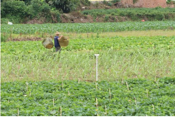
Farmland in China characterized by greater crop diversity, featuring a variety of crop types in smaller fields.

One of the main drivers of declines in biodiversity is increased farming to raise food production, so boosting the diversity of wildlife on farmlands is key in helping the environment.