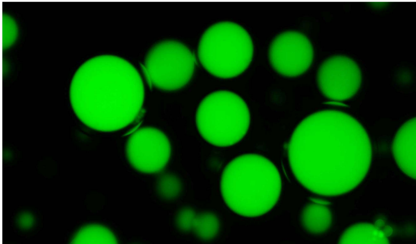
Fluorescence microscopy photo of the laser-activated microdroplets developed by NTU Singapore-led researchers.

The microdroplet serves as a focal point for laser light. When the laser enters the droplet, its energy and light are amplified as the laser reflects and bounces inside the droplet repeatedly before exiting the droplet. This creates a stronger energy signal that is emitted from the droplet, leading to more accurate, precise and easily detectable signals.