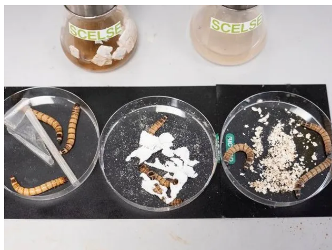
The NTU scientists fed the worms with different plastic diets and extracted the microbiomes from their gut, incubating them in flasks to form an artificial ‘worm gut’.