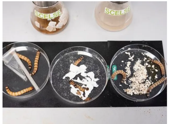
The NTU scientists fed the worms with different plastic diets and extracted the microbiomes from their gut, incubating them in flasks to form an artificial ‘worm gut’.