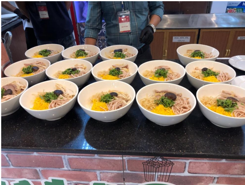
Bun thang or a colorful combo of noodle soup with chicken, pork, and egg served at lunch.

TAG: VIETNAM NEWS VIETNAM SINGAPORE YOUTH