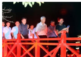
Singaporean Prime Minister takes a stroll around Hoan Kiem Lake

News Hanoi news Opinion Investment Travel My HaNoi Social Affairs Economy Arts & Entertainment Health & Education