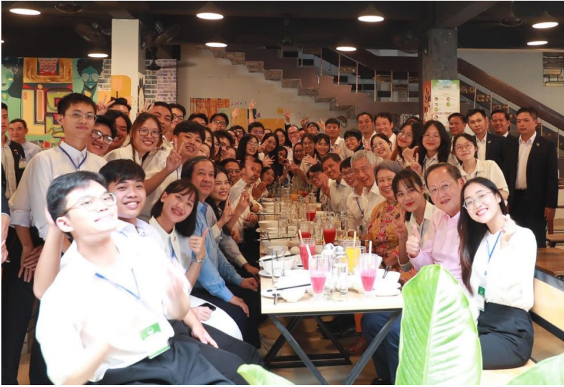
Two prime ministers and their spouses posed with VNU students.