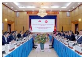
Vietnam, Singapore strengthen economic ties on 5 key priorities