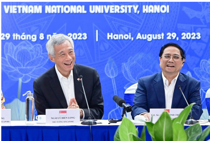
Vietnamese Prime Minister Pham Minh Chinh (R) and Singaporean Prime Minister Lee Hsien Loong at the Vietnam–Singapore Youth Leaders Exchange Program 2023 held in Hanoi on August 29.

HANOI TIMES Singaporean Prime Minister Lee Hsien Loong said the youth of the countries are one of the most important resources because the future depends on them.