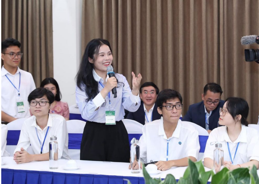
A university student shares her opinion with the two prime ministers at the meeting.

For such reasons, the opportunities between Singapore and Vietnam are considerable.