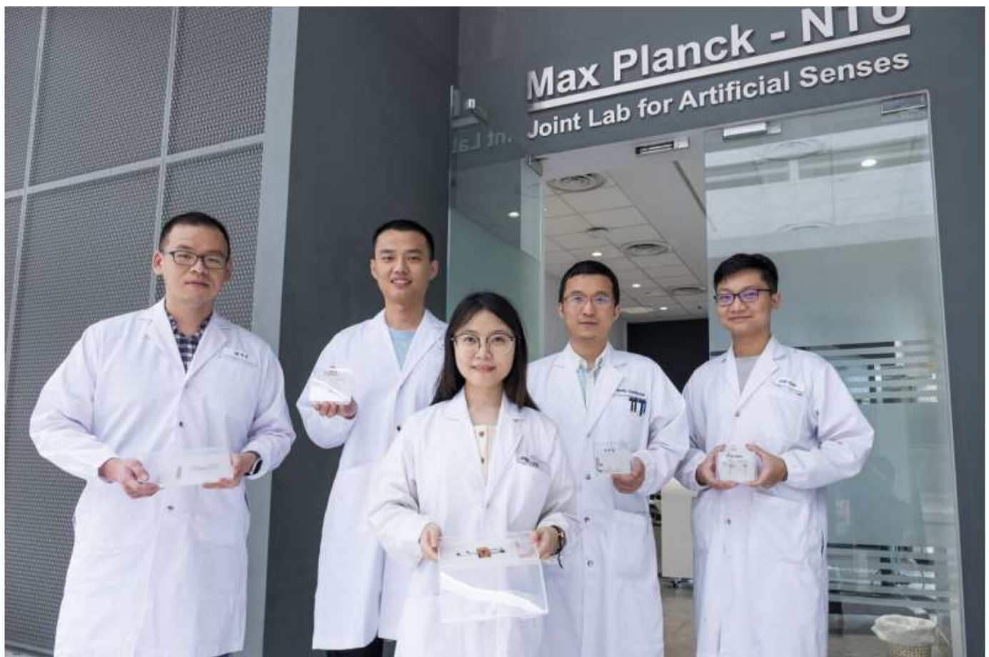
Members of the NTU Singapore research team behind the BIND interface.

When attached to rat models, recordings from the stretchable monitoring device showed reliable signal quality despite interferences on the wirings, such as touching and tugging. When stuck on human skin, the device collected high-quality electromyography (EMG) signals that measure electrical activity generated in muscles during muscle contraction and relaxation, even underwater.