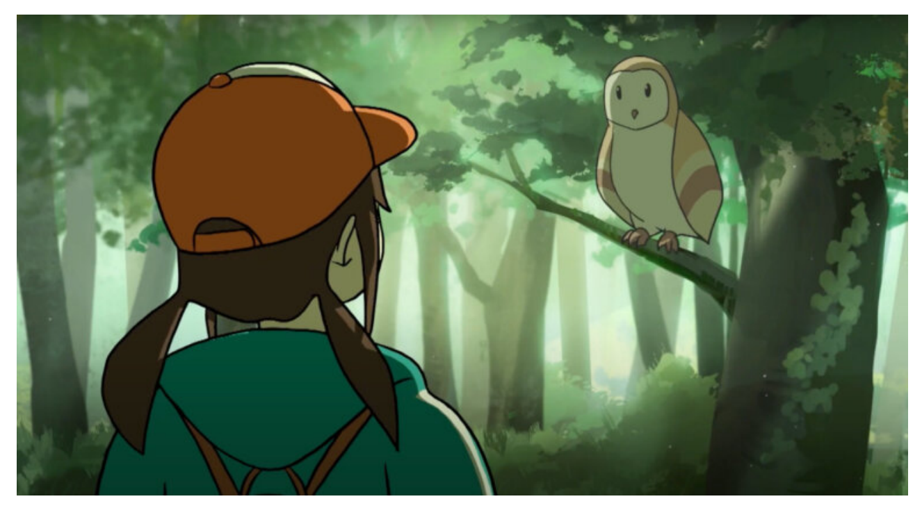
In Earth Girl Nature, the protagonist meets an owl who takes her to see mangrove forests, wetlands and waterways.

The second episode, Earth Girl Nature, explores how nature, including mangrove forests, wetlands and waterways can contribute to lessen the impact of climate change through interconnected systems.