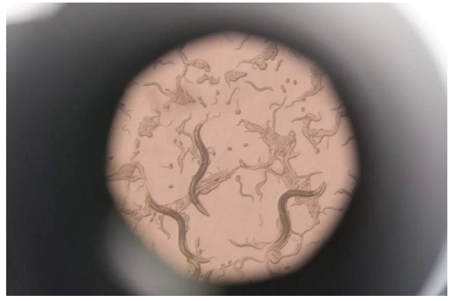
In the lab, roundworms make good models for research on human diseases since they also share similar genes and molecular pathways

With a fast-growing ageing population, healthy and successful ageing has been an area of focus in Singapore. In 2019, the Britain-based Aging Analytics Agency reported that there were 15 research centres in Singapore focused on longevity.