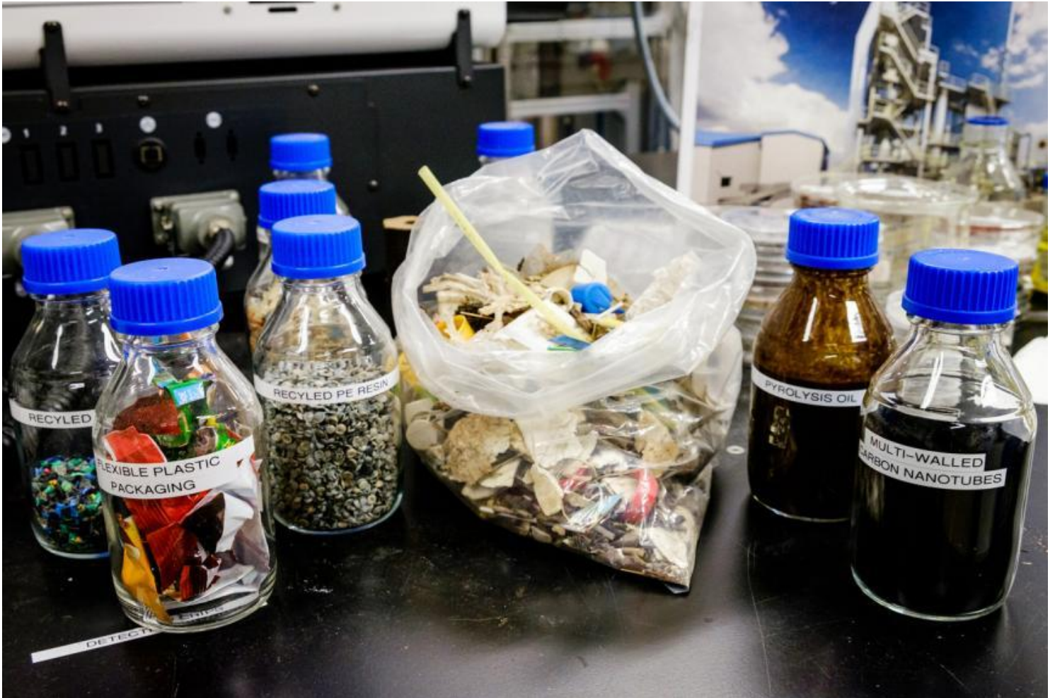
Different types of plastics, including marine litter (centre), that can be turned into hydrogen and carbon nanotubes.