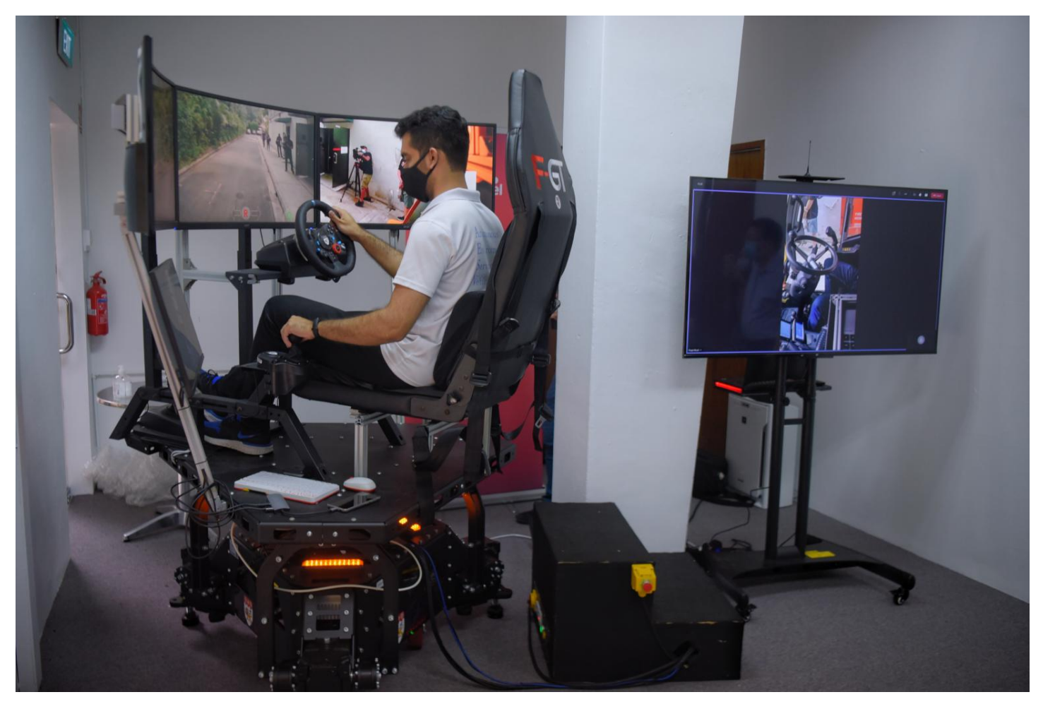
The teleoperation system that an operator uses to control the roadsweeper looks akin to a driving simulator and creates the illusion that he is sitting in the actual vehicle in Sentosa.