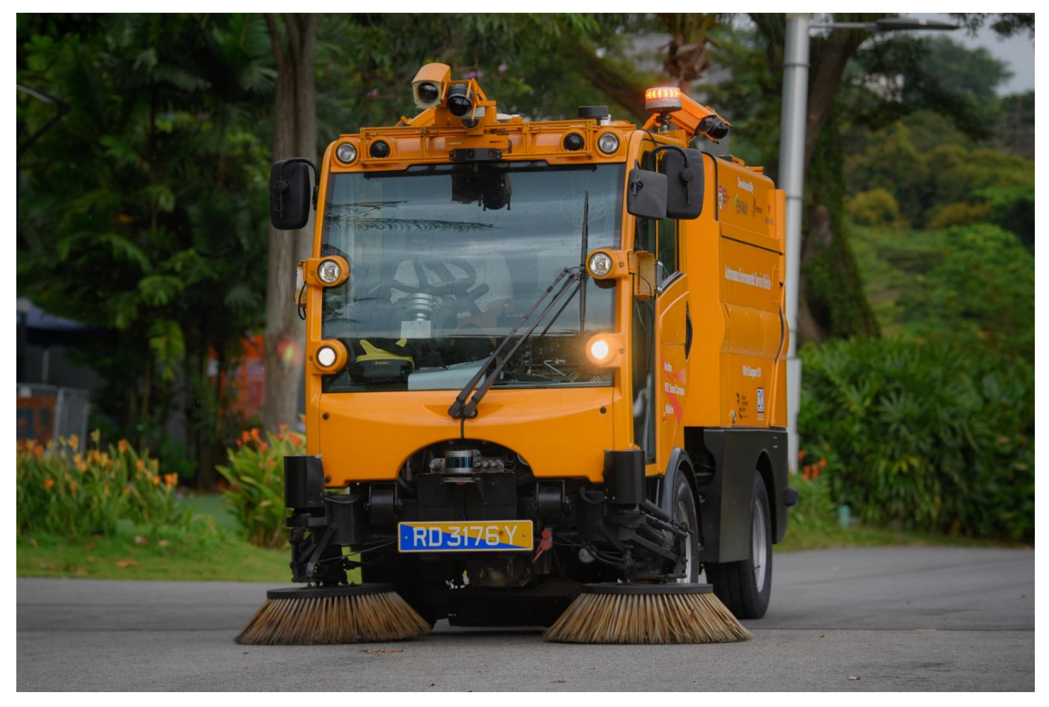
A driverless roadsweeper vehicle in Sentosa. The vehicle can be controlled by an operator from elsewhere.