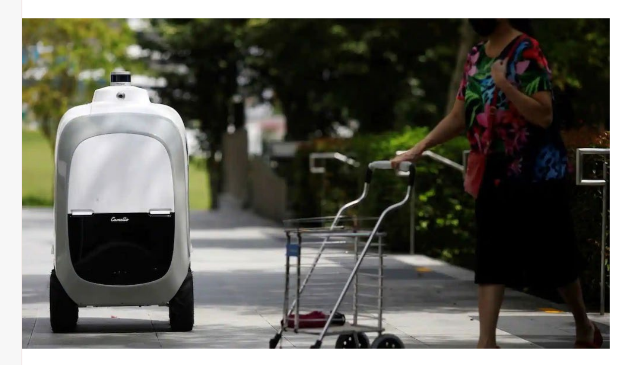
Otsaw's Camello robot

Foodpanda's trial with FoodBots will run from May to November 2021, with plans to expand to other areas in Singapore.