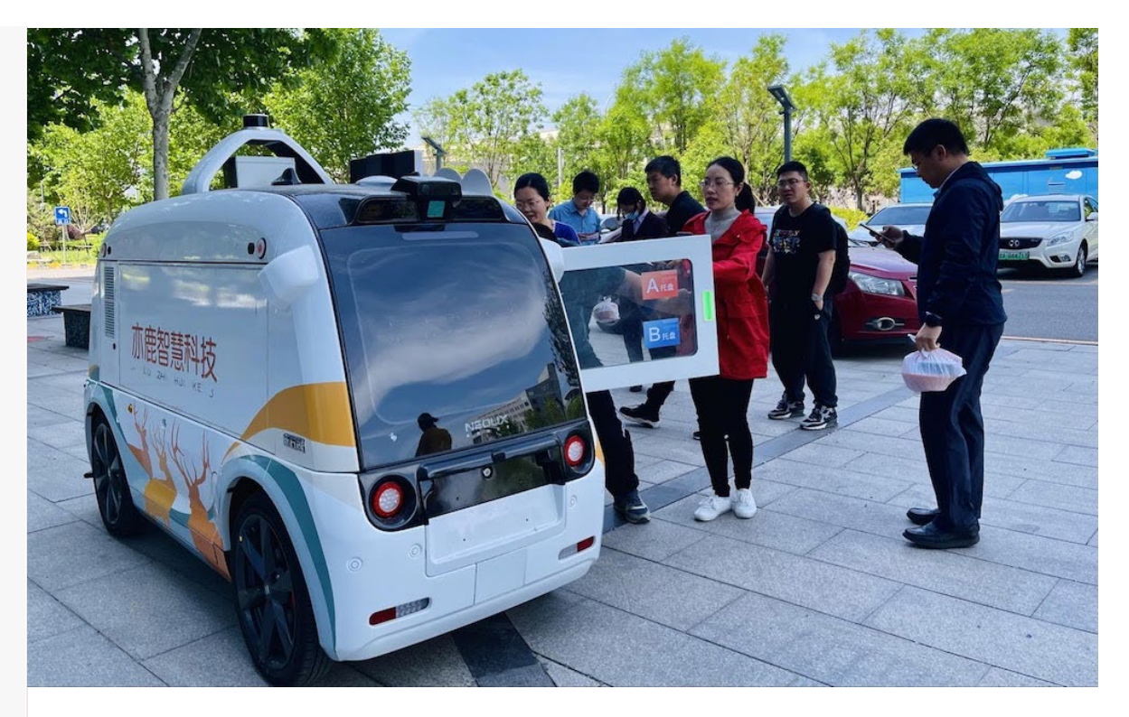
Neolix autonomous vehicle

On the other hand, Neolix's autonomous vehicles will not only be able to deliver food orders in National University of Singapore's (NUS) University Town, but can also double as mobile convenience stores during off-peak mealtimes.