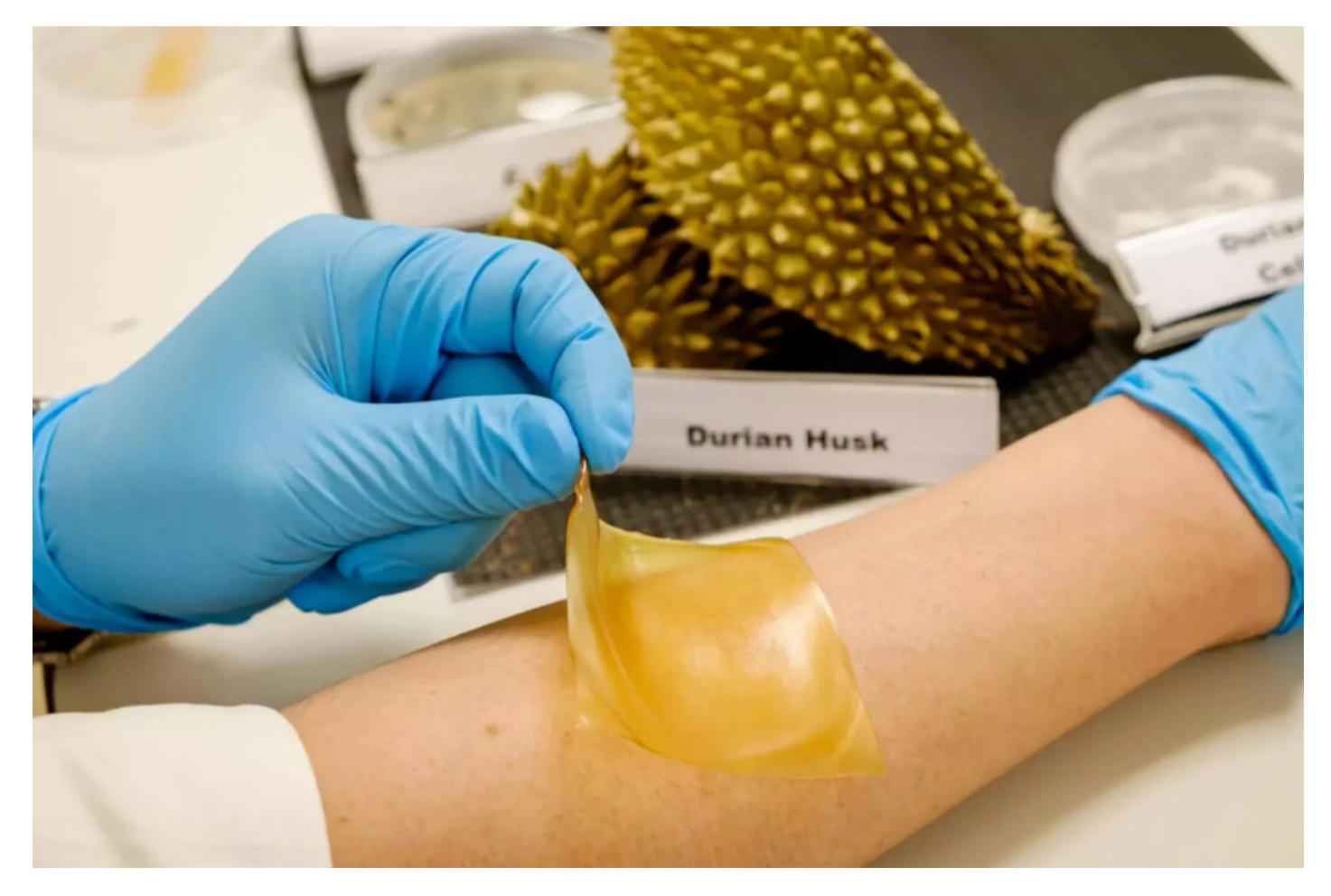
The durian hydrogel bandages are applied directly to the skin.