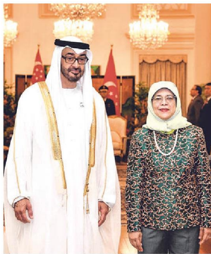
The Crown Prince of Abu Dhabi received a ceremonial welcome at the Istana yesterday morning and paid a courtesy call on President Halimah Yacob, who hosted him to an official lunch.

The Crown Prince also visited semiconductor firm Global Foundries, which is owned by Abu Dhabi's Mubadala Investment Company. Abu Dhabi is the largest of the