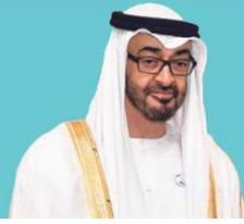
SHEIKH MOHAMED BIN ZAYED AL NAHYAN ABU DHABI CROWN PRINCE ON OFFICIAL VISIT TO SINGAPORE; AGREEMENTS SIGNED B2