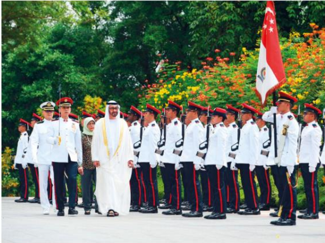
Shaikh Mohammad and Singapore President Halimah Yacob inspect a guard of honour at the Istana Presidential Palace in Singapore.

They also stressed the importance of redoubling efforts by the international community to achieve regional and international peace and security, while also consolidating concepts of tolerance, dialogue and coexistence among various nations and peoples of the world.