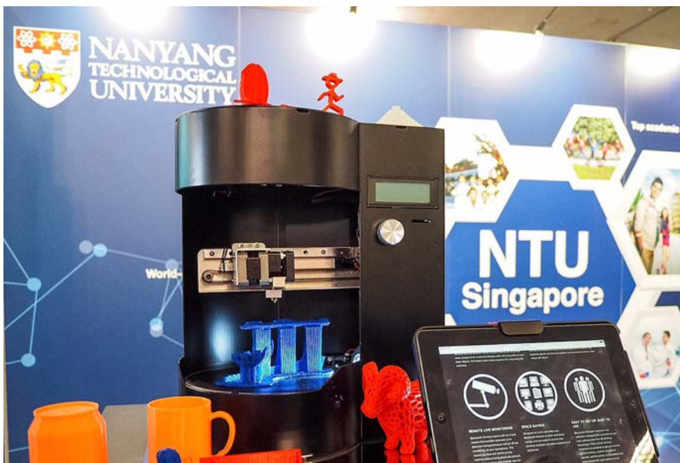
World's first compact 3D printer cum scanner developed by NTU startup Blacksmith Group showcased at the AAAS conference in San Jose, USA