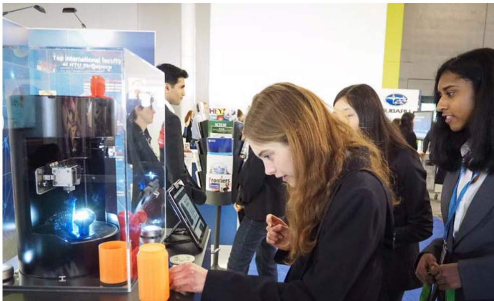
NTU start-up Blacksmith Group launches world's first compact rotary 3D printer-cum-scanner at the annual AAAS conference in San Jose, USA