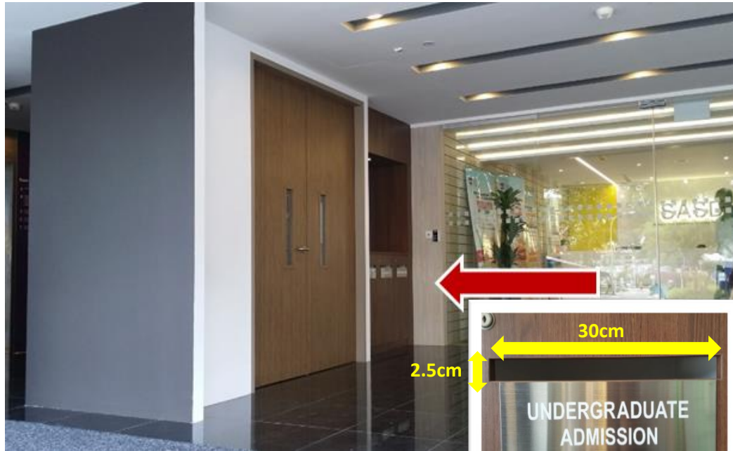
Dimension: 30cm x 2.5cm