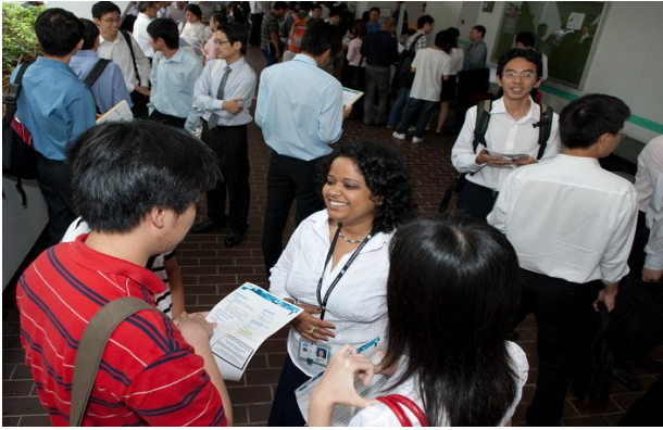
Interactions between participants and company representatives