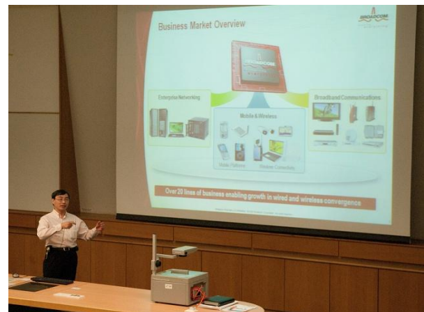
Presentation by Broadcom Singapore