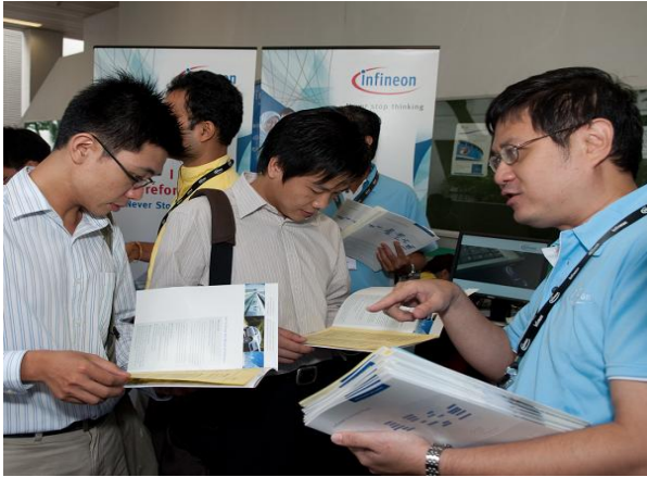
A company representative in action