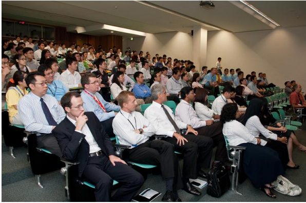
Audience captivated by the interesting Presentations ...