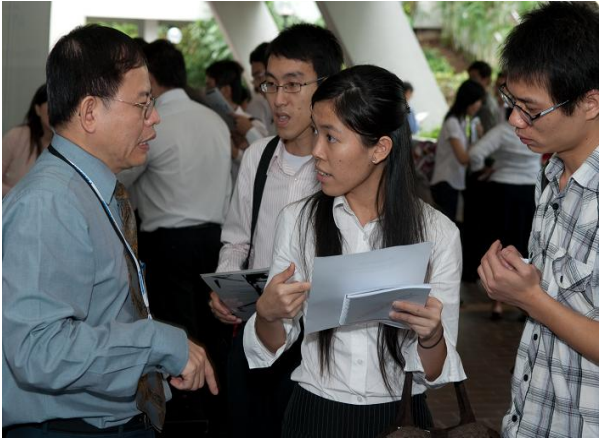
Enthusiastic students finding out more about the companies ...