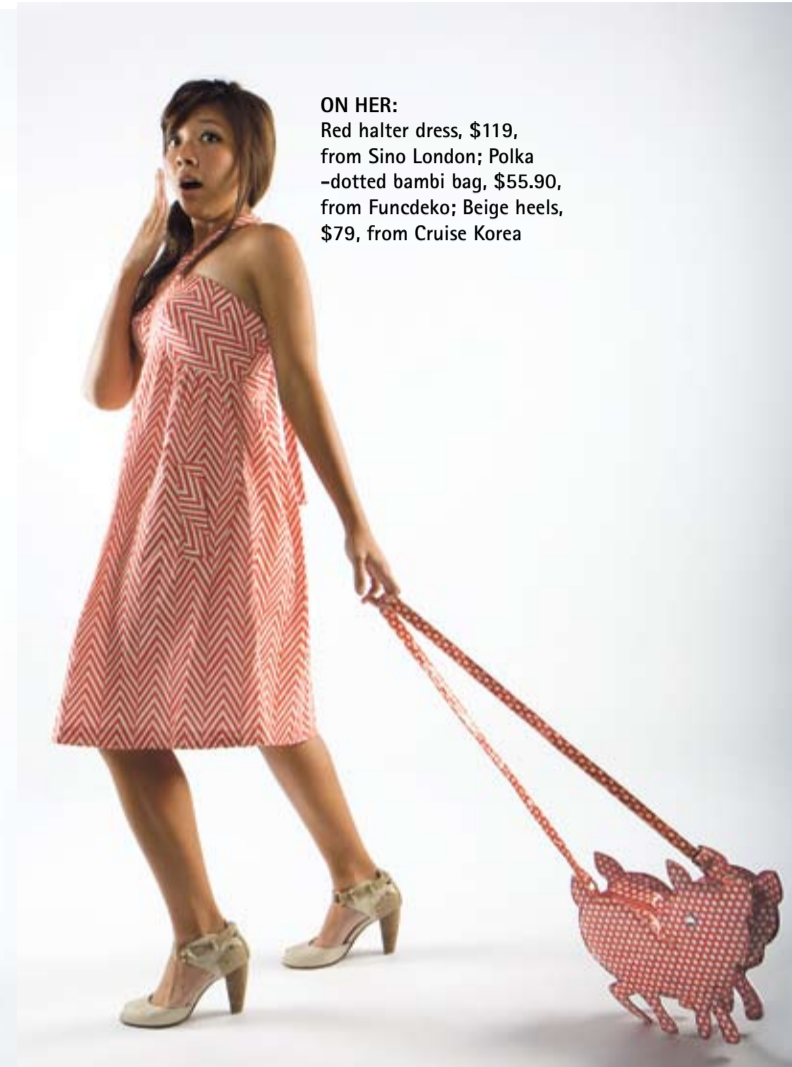
ON HER: Red halter dress, $119, from Sino London; Polka-dotted bambi bag, $55.90, from Funcdeko; Beige heels, $79, from Cruise Korea