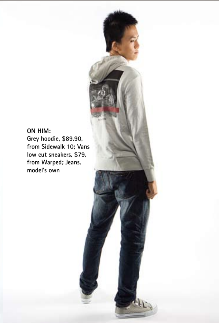
ON HIM: Grey hoodie, $89.90, from Sidewalk 10; Vans low cut sneakers, $79, from Warped; Jeans, model's own