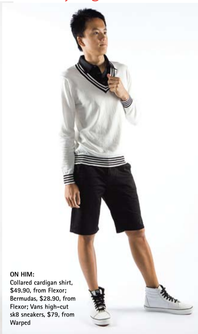
ON HIM: Collared cardigan shirt, $49.90, from Flexor; Bermudas, $28.90, from Flexor; Vans high-cut sk8 sneakers, $79, from Warped