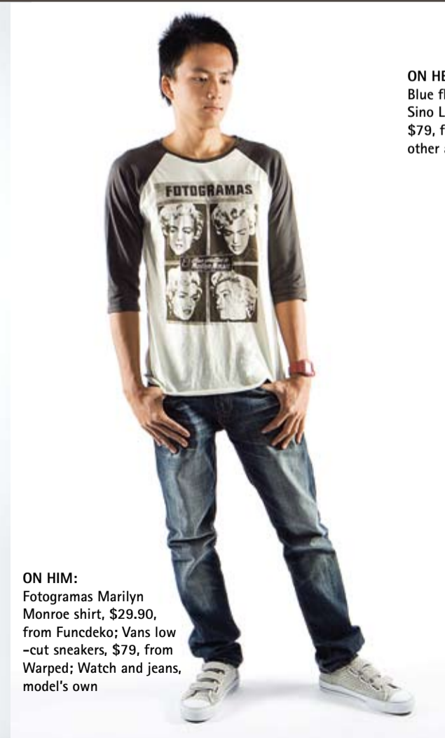
ON HIM: Fotogramas Marilyn Monroe shirt, $29.90, from Funcdeko; Vans low-cut sneakers, $79, from Warped; Watch and jeans, model's own