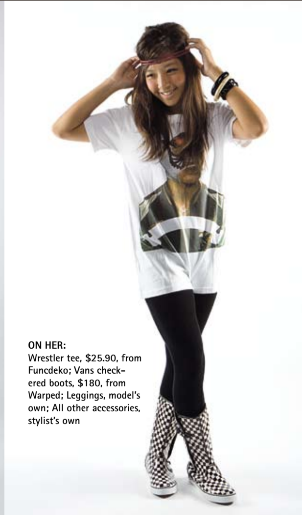
ON HER: Wrestler tee, $25.90, from Funcdeko; Vans checkered boots, $180, from Warped; Leggings, model's own; All other accessories, stylist's own