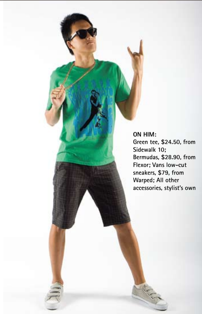
ON HIM: Green tee, $24.50, from Sidewalk 10; Bermudas, $28.90, from Flexor; Vans low-cut sneakers, $79, from Warped; All other accessories, stylist's own

Tees and dresses have become wardrobe staples for weathering the summer heat. Dapper Editors Carina Koh and Audrey Tsen show you ways to create effortless style statements with casual pieces that are easy to mix and match.