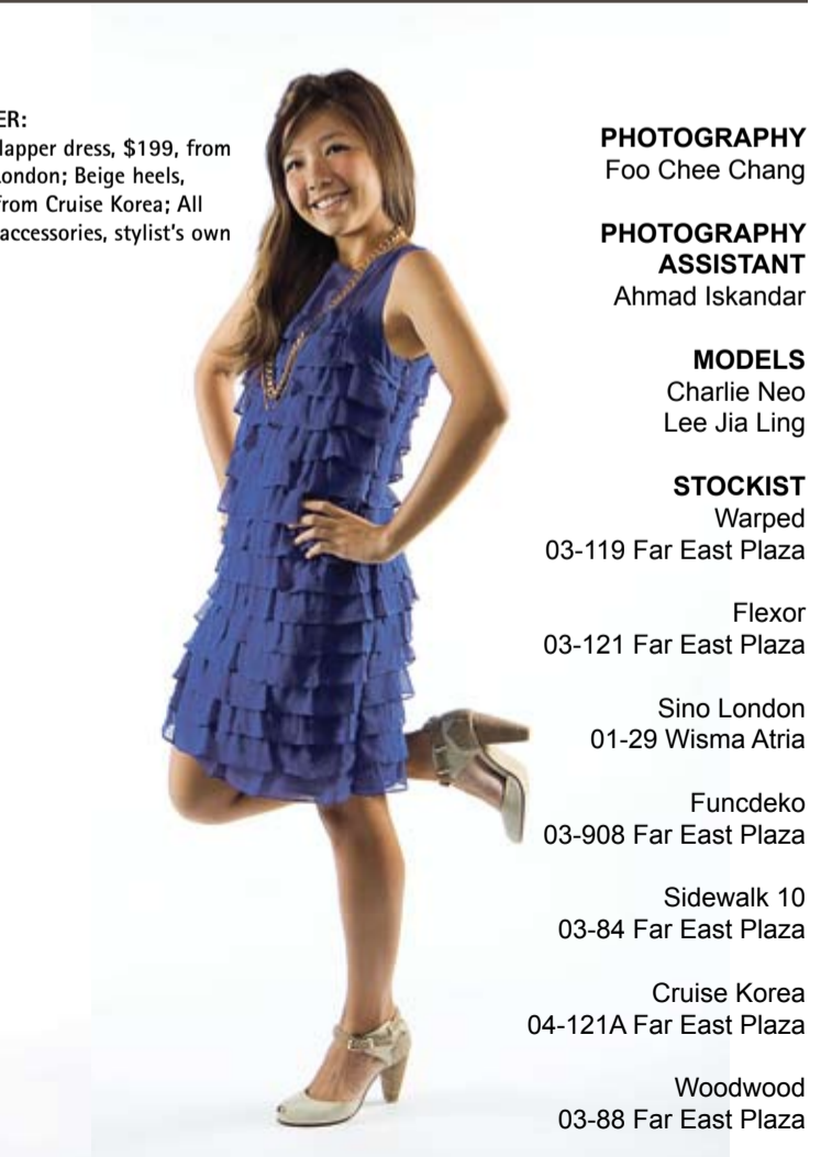
ON HER: Blue flapper dress, $199, from Sino London; Beige heels, $79, from Cruise Korea; All other accessories, stylist's own