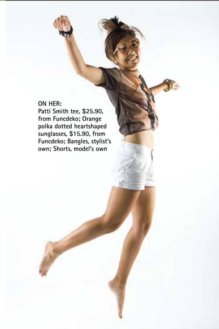
ON HER: Patti Smith tee, $25.90, from Funcdeko; Orange polka dotted heartshaped sunglasses, $15.90, from Funcdeko; Bangles, stylist's own; Shorts, model's own