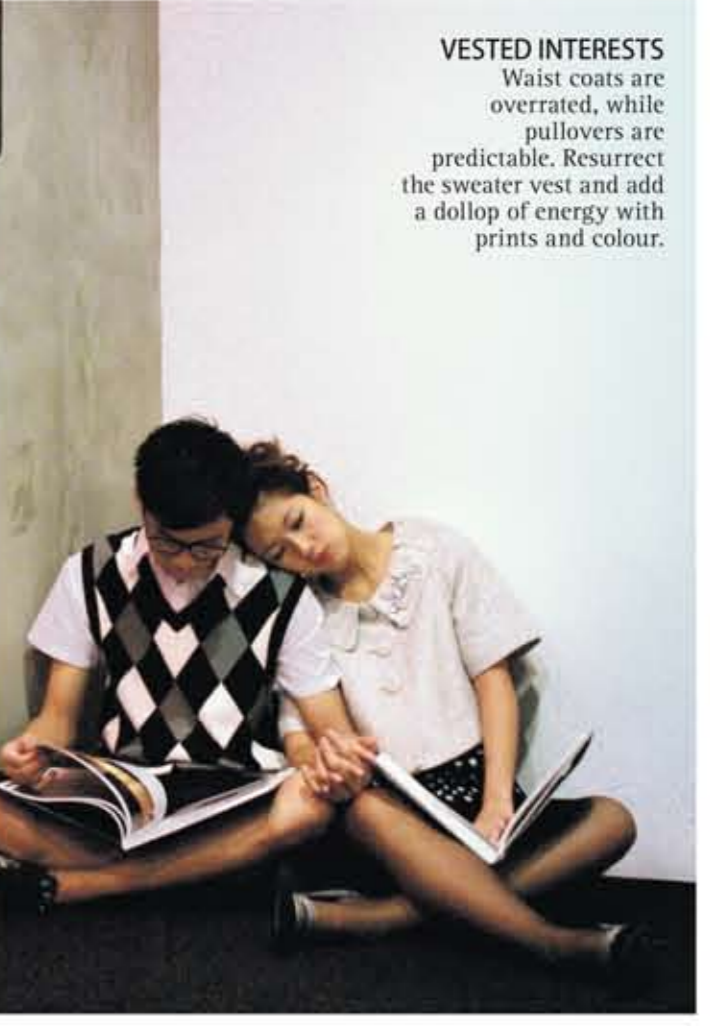
On her: Cardigan, $35, from Collage Workshop, 04-138 Far East Plaza. All other items, stylist's own.

VESTED INTERESTS Waist coats are overrated, while pullovers are predictable. Resurrect the sweater vest and add a dollop of energy with prints and colour.