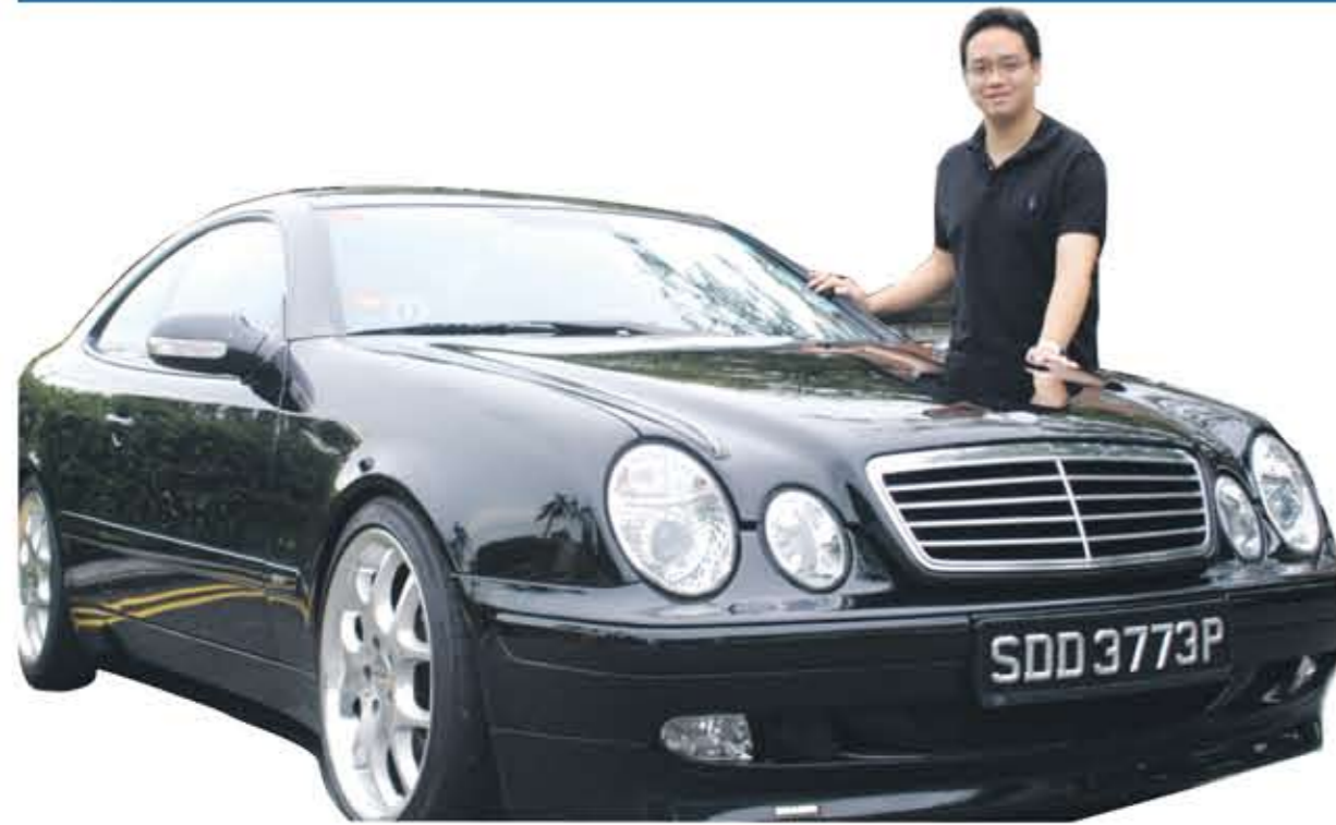
THE MERCEDES-BENZ CLK CLASS, TWO-DOOR COUPE ENGINE: 193 HORSEPOWER; ACCELERATION: 0-60MPH IN 8.3 SECS TOP SPEED 243 KM/H