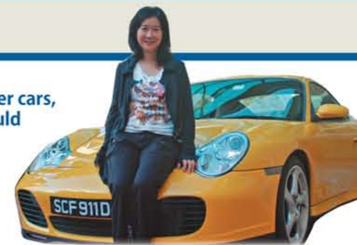
2002 PORSCHE 996 C4S; TWO-DOOR REAR ENGINE ALL-WHEEL DRIVE; ENGINE: 320 HORSEPOWER ACCELERATION: 0-60MPH IN 6.8 SECS TOP SPEED 280 KM/H

"Had it been other cars, I don't think I could have made it."