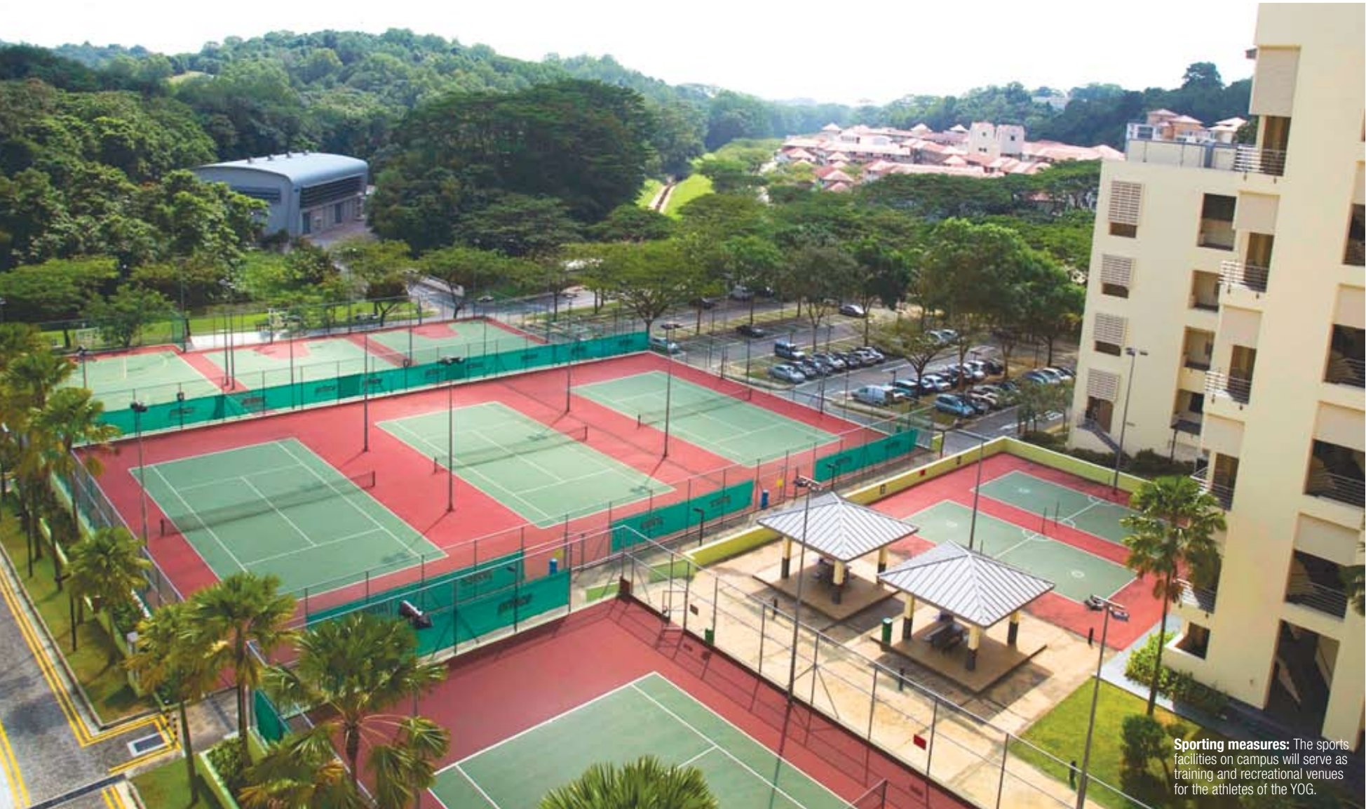
Sporting measures: The sports facilities on campus will serve as training and recreational venues for the athletes of the YOG.