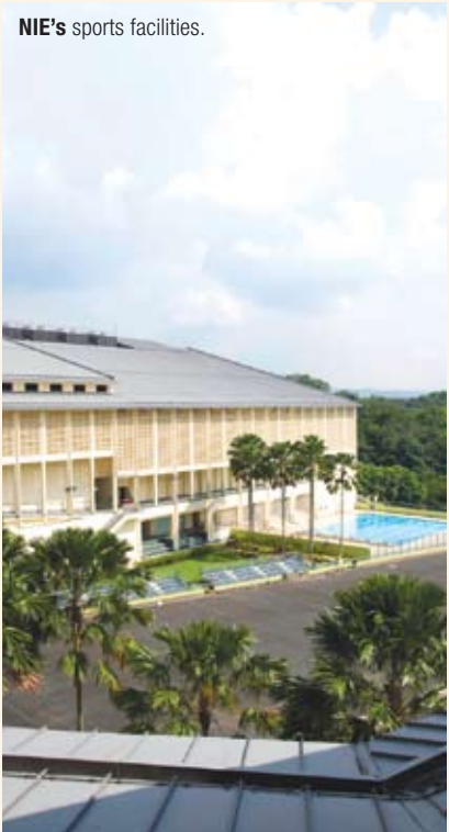
NIE's sports facilities.