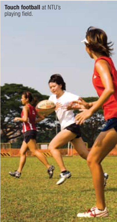
Touch football at NTU's playing field.