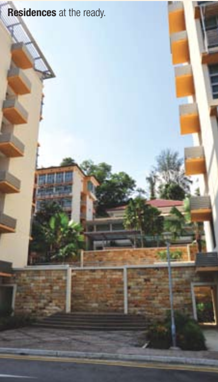
Residences at the ready.