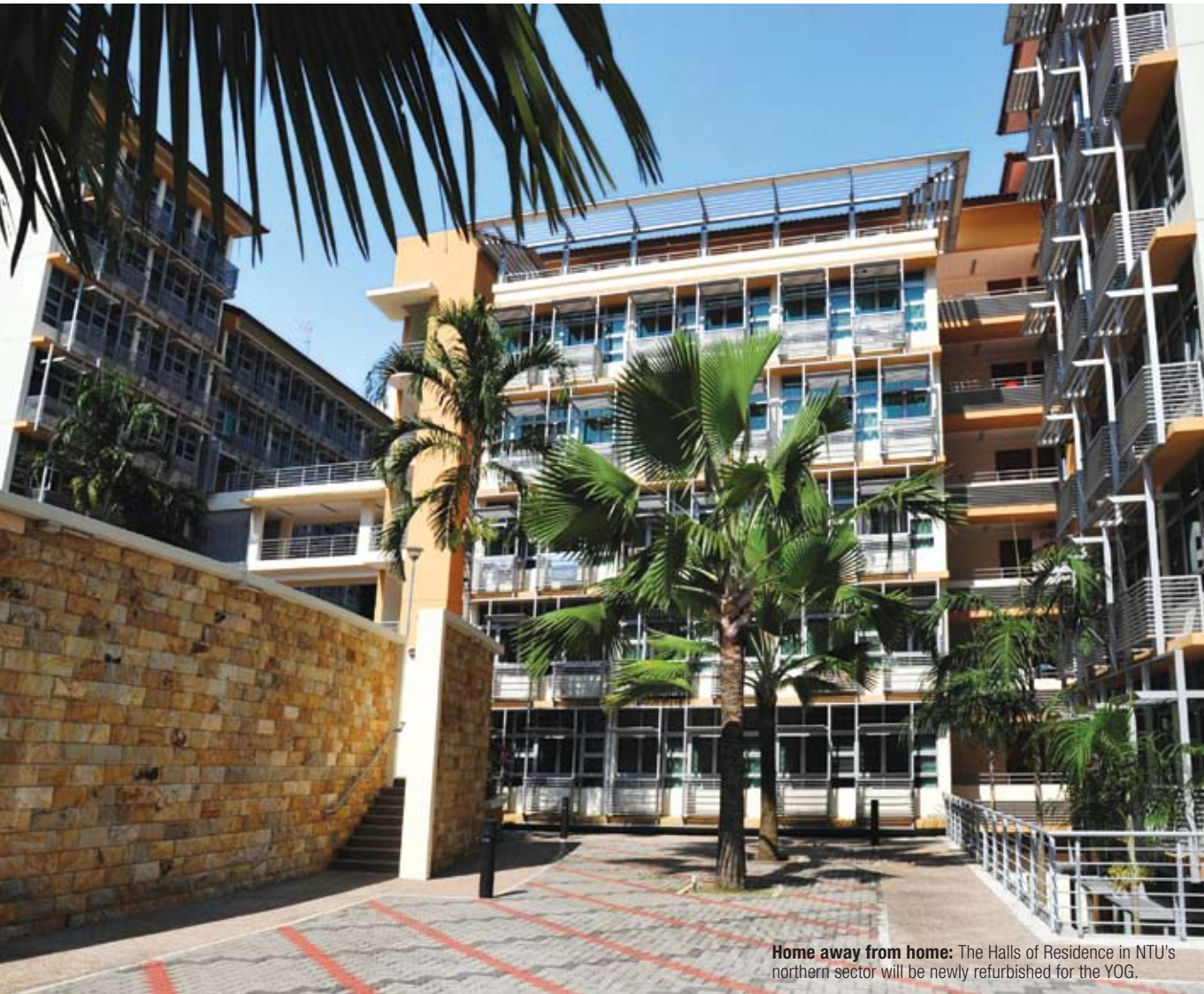
Home away from home: The Halls of Residence in NTU's northern sector will be newly refurbished for the YOG.

Following a spirited nationwide campaign, the announcement in February 2008 that Singapore had won the bid to host the YOG was greeted with euphoria. In the original proposal by the Singapore Youth Olympic Games Organising Committee (SYOGOC), the Village was intended to be the National University of Singapore's University Town (currently under construction). In August 2008, the SYOGOC made the decision for practical reasons to shift the Village to the alternative site of NTU.