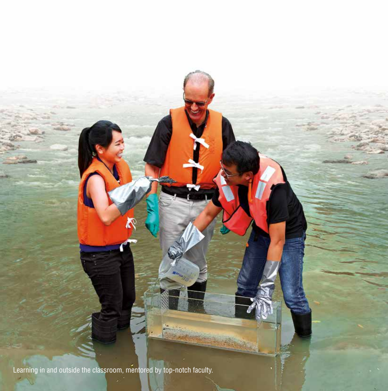
Learning in and outside the classroom, mentored by top-notch faculty.