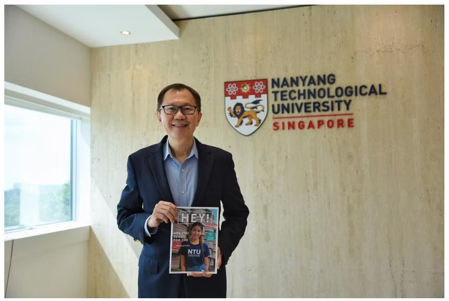
NTU president Ho Teck Hua with the latest issue of campus publication HEY!, a magazine co-created with generative Al technologies.