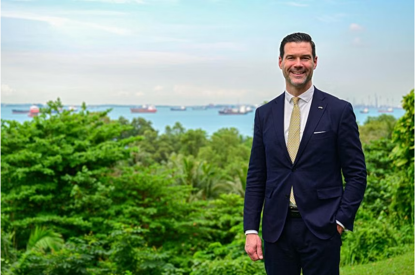
Swedish Minister for International Development Cooperation and Foreign Trade Johan Forssell in Singapore for the Sweden Indo-Pacific Business Summit on Dec 5.