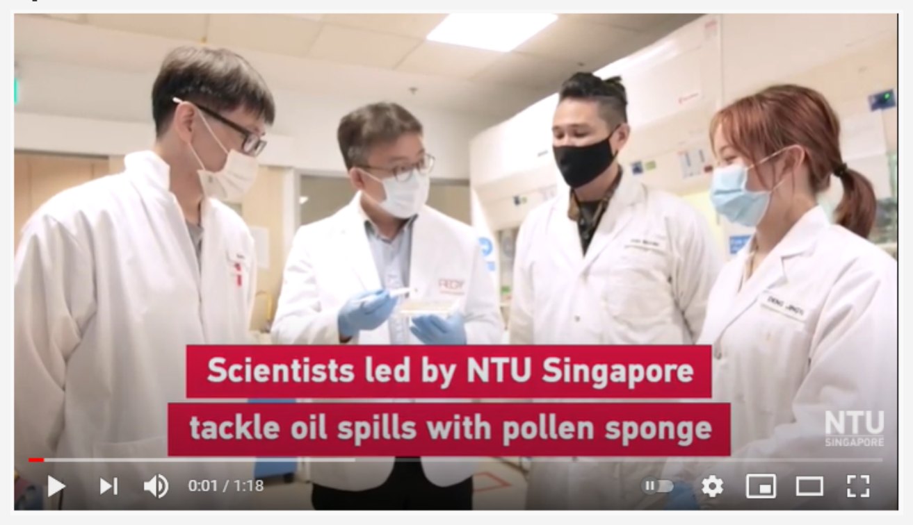
Top image from NTU Singapore