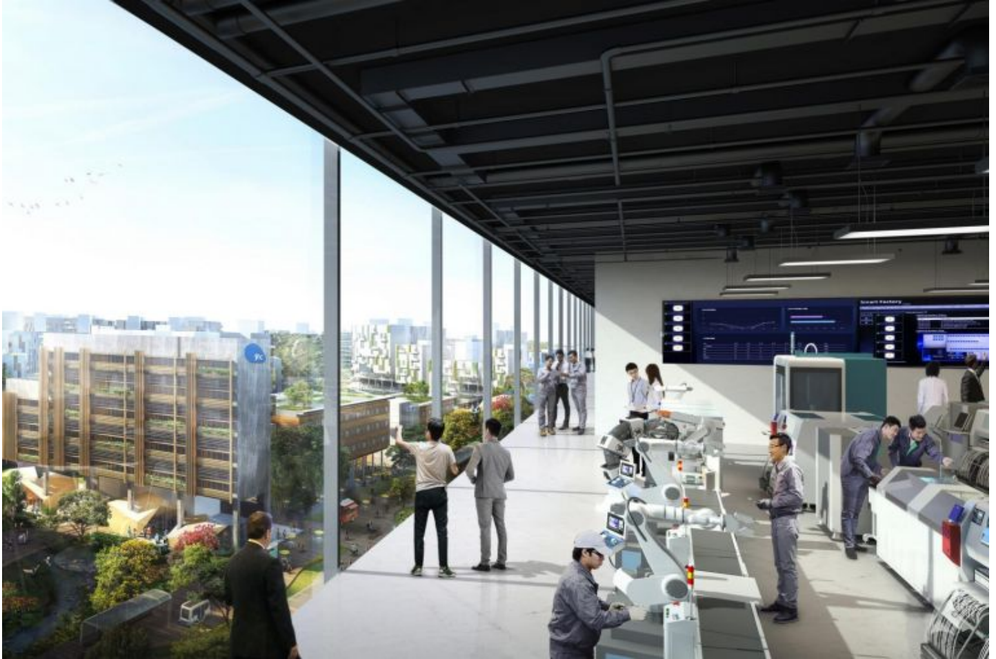
An artist's impression of Jurong Innovation District (JID), located near Nanyang Technological University.

It will also work to predict what skills and knowledge such workers will need to meet future industry requirements.