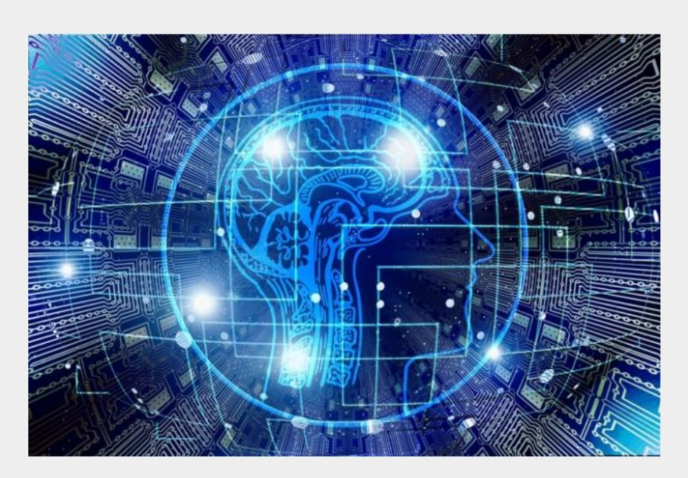
An international research team used an advanced neural network machine-learning system to improve the accuracy of tests probing the plastic properties of materials — which can be important in a wide variety of industrial applications.

With advances in nanotechnology during the past two decades, the indentation force can be measured to a resolution on the order of one-billionth of a Newton (a measure of the force approximately equivalent to the force you feel when you hold a medium-sized apple in your hand), and the sharp tip's penetration depth can be captured to a resolution as small as a nanometer, or about 1/100,000 the diameter of a human hair. Such instrumented nanoindentation tools have provided new opportunities for probing physical properties in a wide variety of materials, including metals and alloys, plastics, ceramics, and semiconductors.