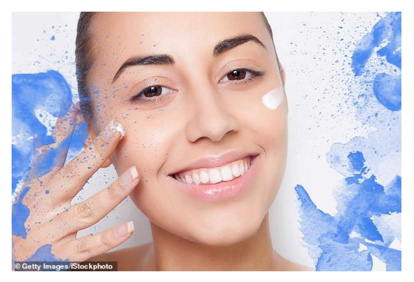
The L'Oreal group is at the forefront of this movement, thanks in no small part to its in-house tech incubator, which helps start-ups with office space and training (stock image)

The same is true of the Olay Skin Advisor app which assesses your 'skin age' and recommends a regime of (obviously) Olay products. You could argue that it's the same as walking into a department store — you don't expect the Clinique counter to recommend Elemis products.