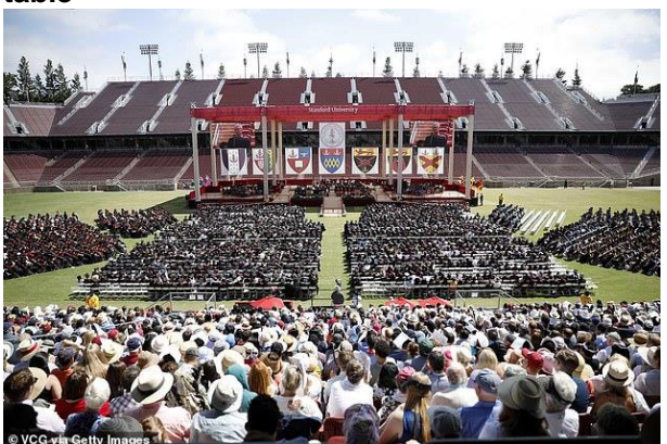
3) Stanford University in the US, where graduating students are seen on Sunday, stayed in third

University College London however rose two places to eighth in the QS World University Rankings, while Imperial College London fell one place to ninth.