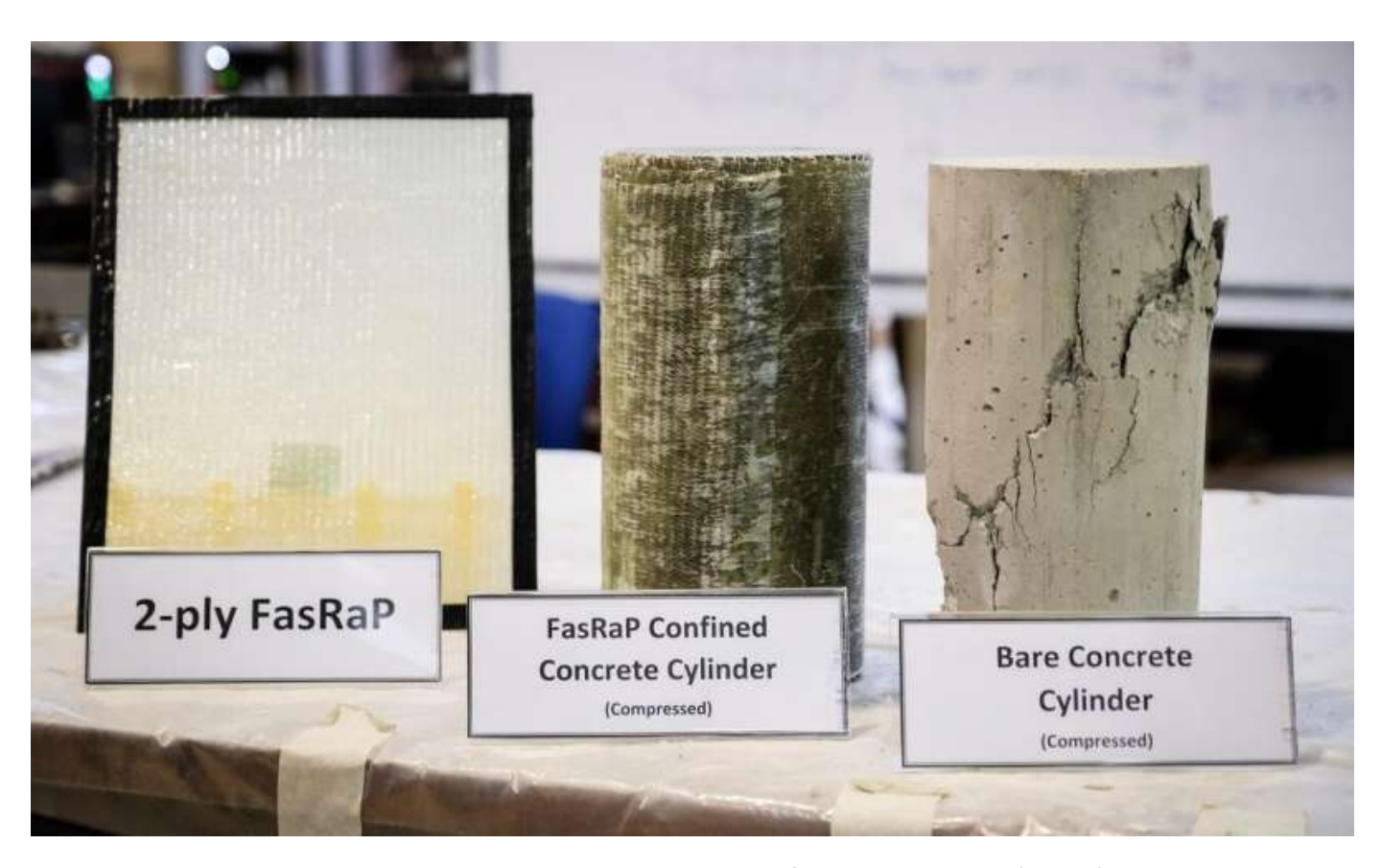
A 2-ply FasRaP hardened by light exposure, a concrete cylinder reinforced with FasRaP (middle) that can withstand twice as the load as the bare concrete cylinder which was cracked under high pressure (right).

At the work site, FasRaP is ready for application directly on the wall or pillar. Only three workers are needed to complete the job, compared to FRPs currently available in the market which typically require a team of up to six workers to install, as the conventional resin needs to be manually applied on site.